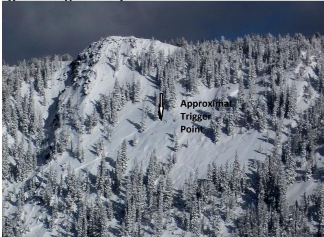
Burial site looking up slide path - Tremper